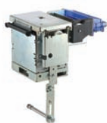
VARIABLE POSITION SPINDLE